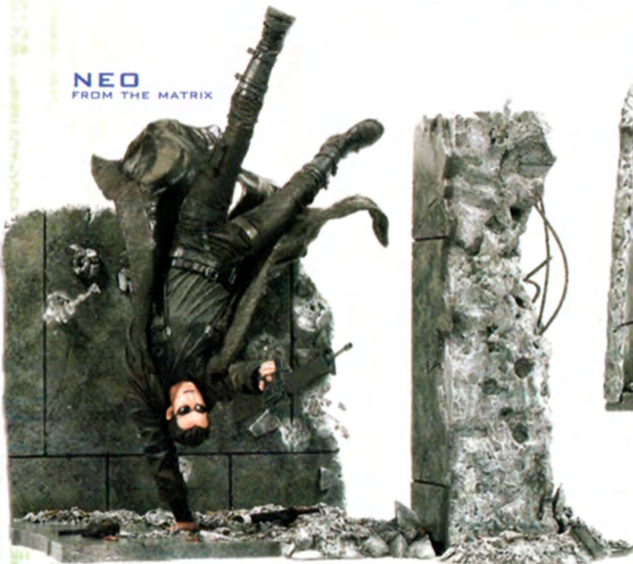
NEO FROM THE MATRIX