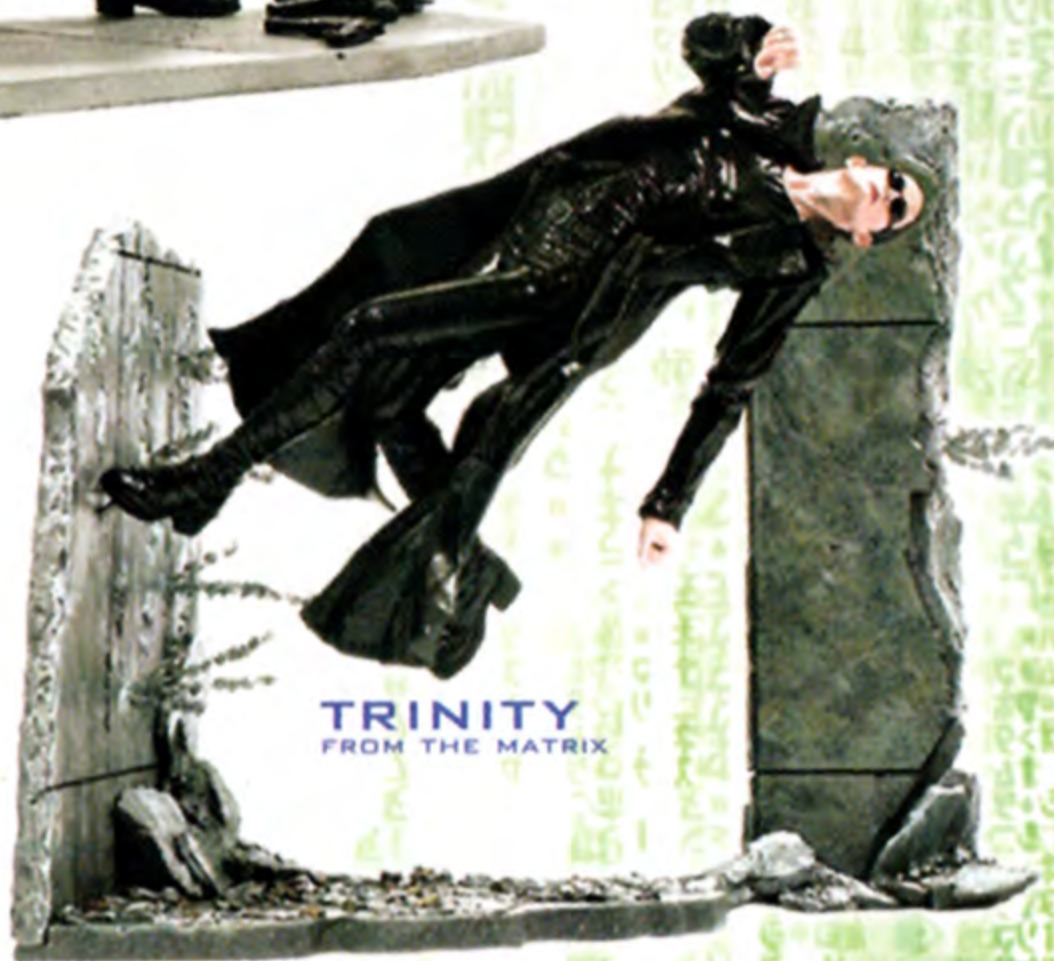
TRINITY FROM THE MATRIX