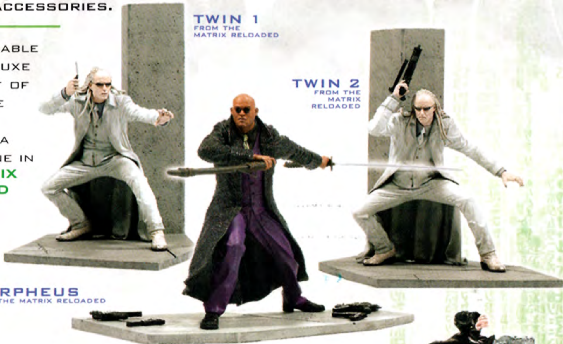
TWIN 1 FROM THE MATRIX RELOADED

ALSO AVAILABLE IS THE DELUXE BOXED SET OF NED IN THE CHATEAU, BASED ON A FIGHT SCENE IN THE MATRIX RELOADED