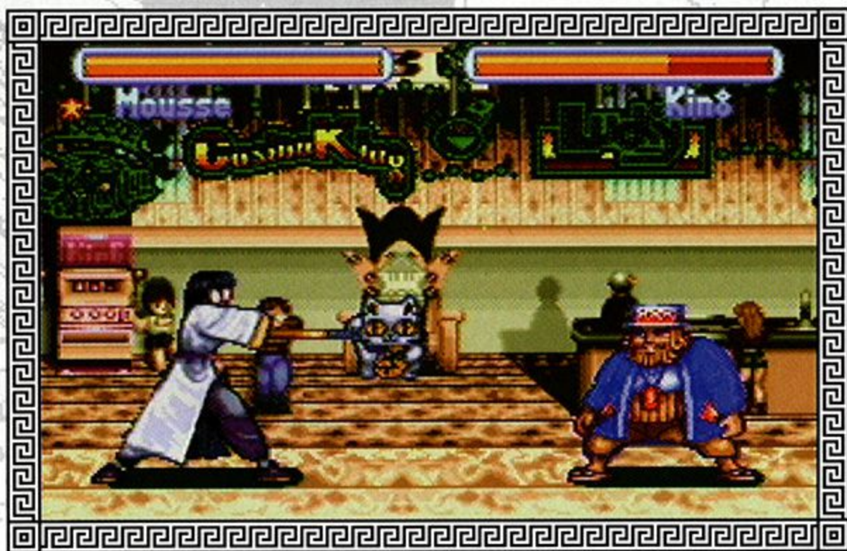
MOUSSE - POUNCING CAT