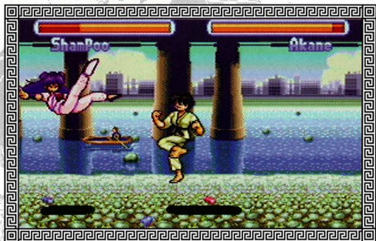
AKANE - FLYING KNEE KICK

Akane is surrounded as usual by a hoard of boys asking her for a date. Her daily routine is to blast them off with a single blow. She pleaded with the principal to impose tighter school discipline. As you might expect, the principal has come up with something a little different.