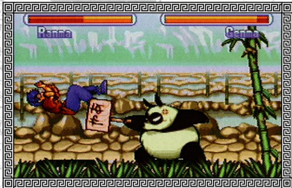
GENMA - SIGNBOARD PUNCH

Having a rebellious son like Ranma has been a big headache and heartache for Genma Saotome. After hearing the principal's pep talk, Genma resolved to achieve his ultimate strength by any means available. In this way he could demonstrate his paternal dignity to the world. Even if it means transforming into a Panda!