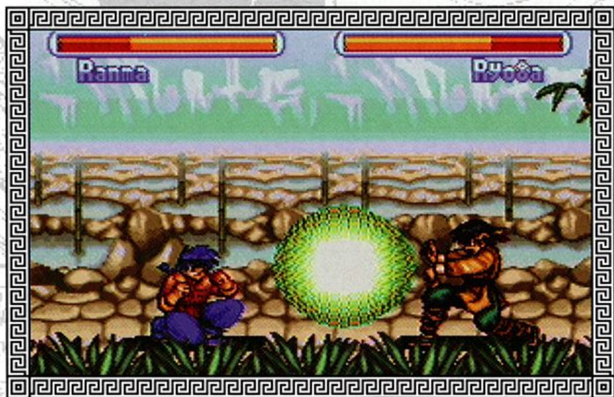
RYOGA - LION'S ROAR BULLET

Ryoga, the wanderer, accidentally lost his memory. He was taken in by the principal's slick talk and fooled into fighting faces from his past - even Akane, his heart-throb! What a loser!