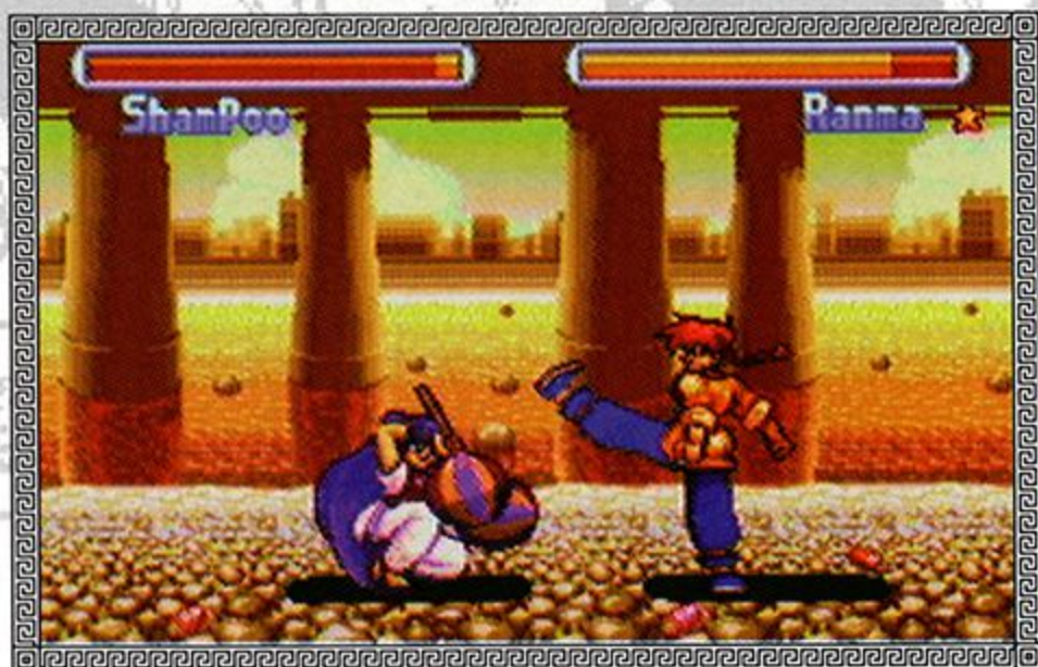
RANMA-CHAN - BASIC KICK