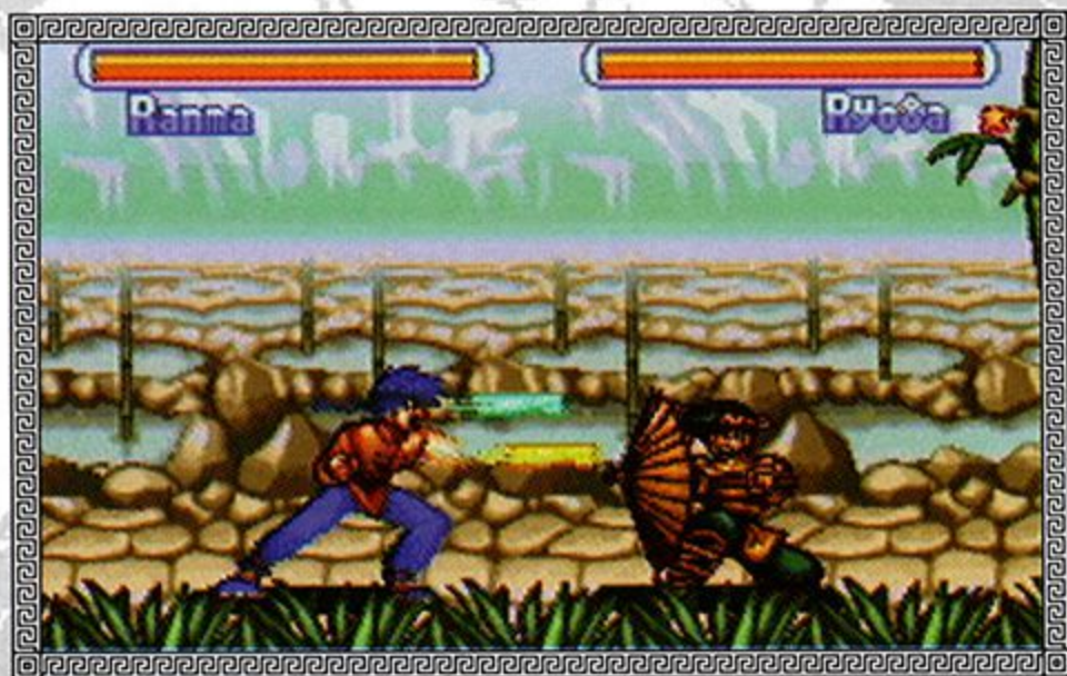
RANMA - SWEET CHESTNUT FIST

Thinking that he would be excused from school exams if he could beat the fighters chosen by the principal, Ranma firmly resolved to devote his time to martial arts training, rather than to the pursuit of academic discipline.