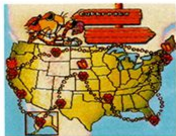
U.S. MAP SCREEN

There are lots of powerups and bonuses (described in the POWERUPS AND SCORING section). And Chester has plenty of running and jumping maneuvers to avoid or to attack his enemies (described in the CONTROLLER FUNCTIONS DURING A GAME section). Chester's only means of getting rid of enemies is to jump on them. In some cases, more than one direct hit is necessary to clear an enemy from the screen.