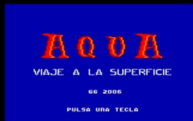
Introducción | Intro