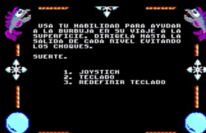
Menú | Menu