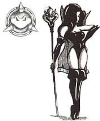
"The Dark Queen"