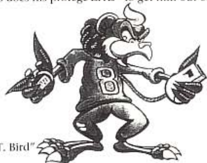
"Professor T. Bird"

The BATTLETOADS mentor is the immortal PROFESSOR T. BIRD, affectionately known as the 'coach'. His harmless bumbling exterior conceals an enormous intelligence and a stupendous magical talent. However, he has renounced their use, preferring science and logical thought - as does his protégé ZITZ - to get him out of trouble.