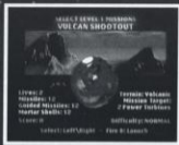
Fig 3. Select Mission Use Joypad left and right to select different missions.

The Federation has analyzed the reconnaissance reports and has divided your mission targets into six increasingly difficult levels, the last being the mission to knock out the atmospheric cannons to allow the armada to enter the planet's atmosphere. Each level consists of missions in different terrain and with different strategic targets; a mission can only be completed when the strategic targets are destroyed. You may choose from the selection of missions by using the left and right Joypad buttons. Details of each mission's reconnaissance report will be revealed to you once you select the mission by pressing the B button.