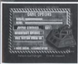
Fig 7. Options menu During gameplay, hit pause and the A, B or C button to bring up this menu.

Abort Mission: Use the left/right Joypad to abort the mission or cancel to return the previous Option menu.