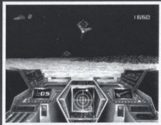
Fig 6. Hovercraft Cockpit

Flares: Not really a weapon, but an aid, to assist on missions on the dark sections of the planet. Use just like mortars.