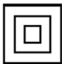
The Black Hole