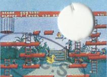
Screen shots from Amiga version