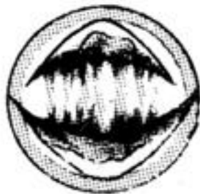
Fig. 9 Vacuum Wave (10 points)