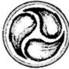
Fig. 10 Invincible Fire Wheel (20 points)