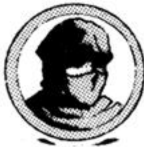
Fig. 4 1 UP