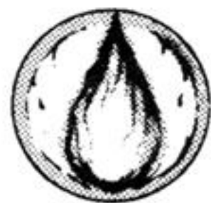
Fig. 8 Fire Wheel (8 points)