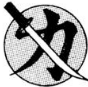
Fig. 5 Dragon Spirit Sword