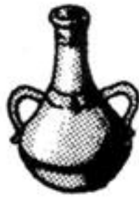
Fig. 2 Recovery Medicine