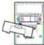
GAME BOY RUMBLE PAK