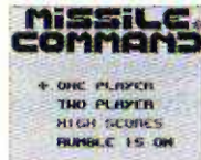
Main Menu Screen

Once the MISSILE COMMAND® Title Screen has appeared, you may press START to display the Main Menu Screen.