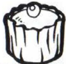
SHUMAI (Steamed Dumpling)