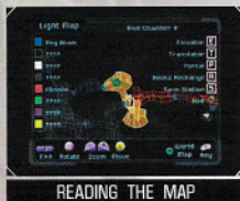
READING THE MAP