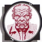
Dr. Wilbur C. Feels

Clarence is the Colonel's attorney. He manages all of the Colonel's business affairs and accounts. He seems rather sneaky, and it is said that he lusts after the Colonel's money.