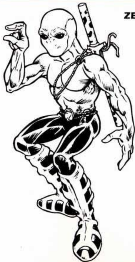
ZEN - INTERGALACTIC NINJA