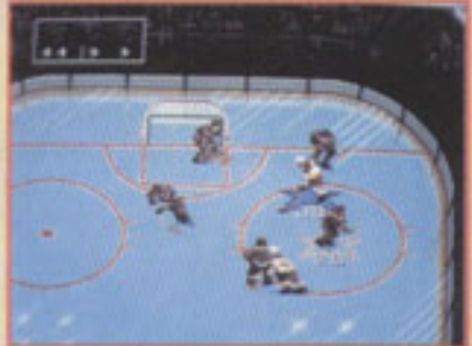
▲ ...and moves into a dangerous position!