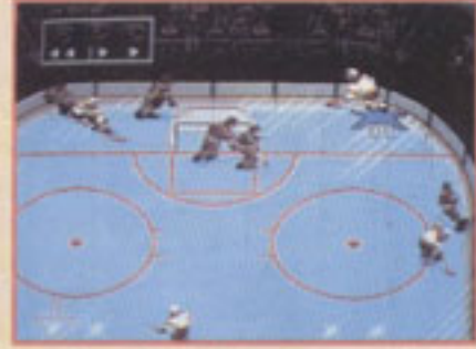
▲ Another white player gets the puke...