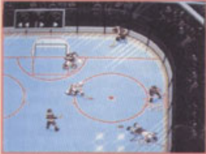
▲ White's down, and the puke's getting lonely!

Players will be pleased to hear that there's a replay option, so that goals, fouls, or even fights can be viewed in slow motion - or even frame by frame!