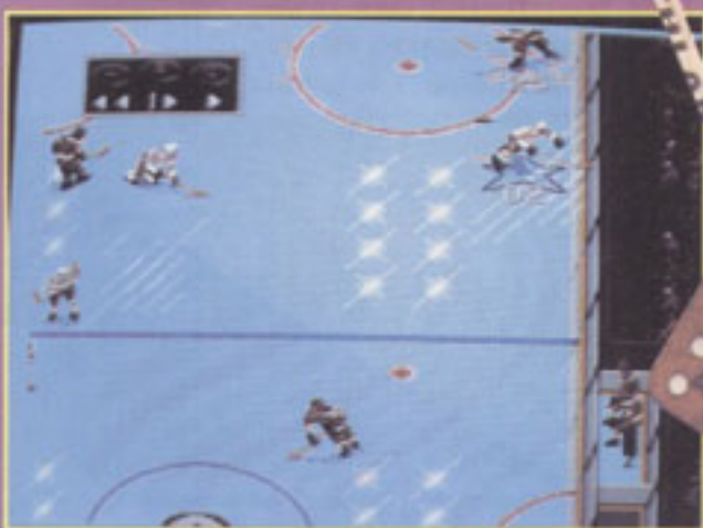
▲ An overhead slash from red...