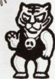
BOSS AREA 5