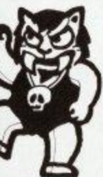
BOSS AREA 4