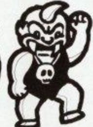
BOSS AREA 6