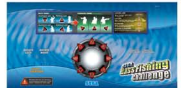
6. Control panel Overlay 557-30-151