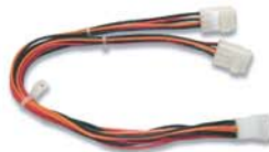
11. Power Supply Harness 557-60-100