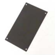
9. Card unit cover plate 523-50-125