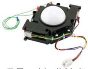
7. Trackball Unit 99-50-205