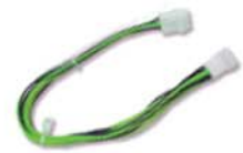
12. Trackball Harness 557-60-101