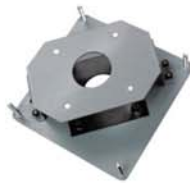
8. Trackball mounting kit 99-50-206