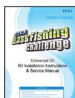
14. Product Manual 557-30-300