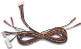
10. Main Harness 99-60-690